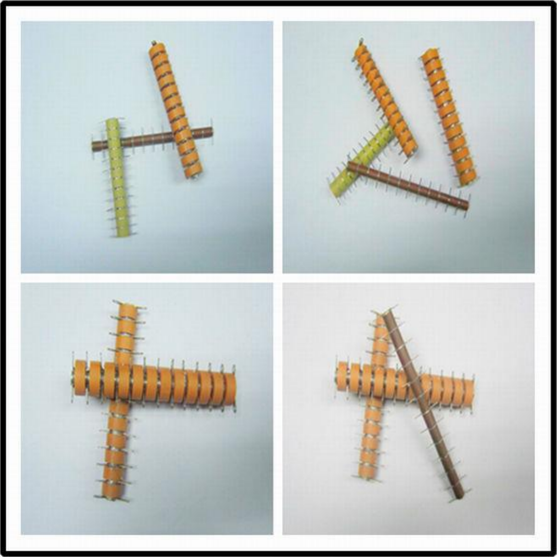
High Voltage Linear Capacitor 20KV 150pf /general electric capacitor

Dongguan Amazing Electronic Co.,Ltd. is specializing in manufacturing various kinds of high voltage and high frequency ceramic capacitors.Welcome to contact us for further information.