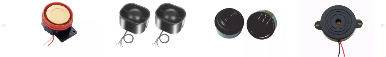
Alarm Buzzer 12V 54*30...