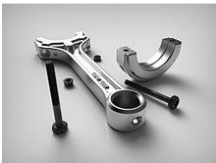
Example of modeling in CATIA

Procter & Gamble (P&G) is using CATIA to optimize its packagings. [58]