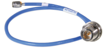
CASE STYLE: KQ1669-XX