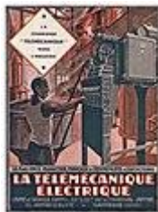
One of the first brochures for Telemecanique industrial control products. Telemecanique was acquired by Schneider Electric in 1988.