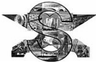
The Schneider logo in the 1950s