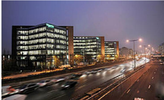
Schneider Electric head office in Paris