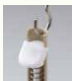
GS-108/158 Hole for hook