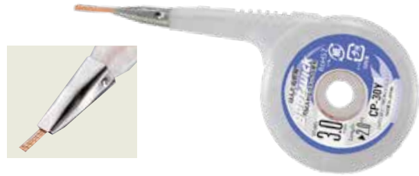
Dispenser pack with stainless steel mouth