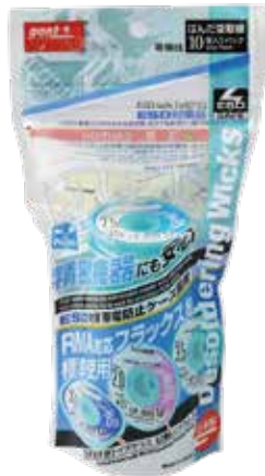
Economical packs of 10pcs