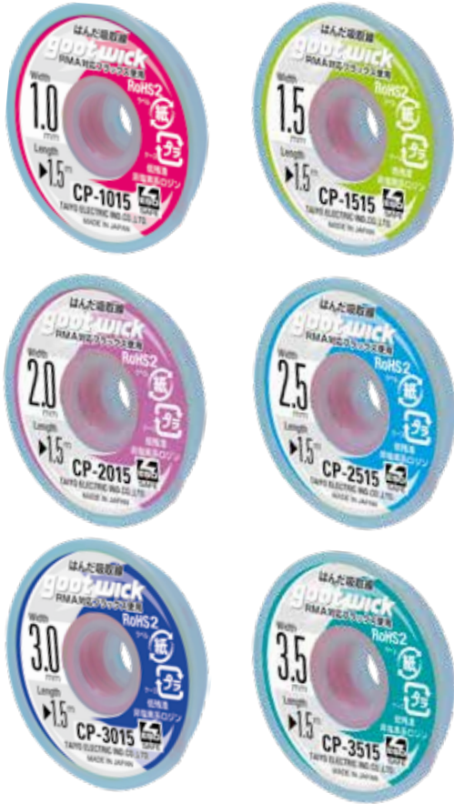
Conventional dispenser pack