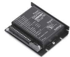
DEC 50/5 1-Q-EC Amplifier 1-quadrant amplifier for controlling EC motors with Hall sensors with a maximum output of 250 watts.