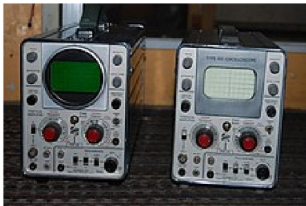
Tektronix 321- Their First Battery Operated Transistor Oscilloscope. LEFT- Later Version RIGHT- Earliest Version

In 1956, a large piece of property in nearby Beaverton became available, and the company's employee retirement trust purchased the land and leased it back to the company. [7] Construction began in 1957 and on May 1, 1959 Tektronix moved into its new Beaverton headquarters campus, [7] on a 313-acre (1.27 km 2 ) site which came to be called the Tektronix Industrial Park. [12]