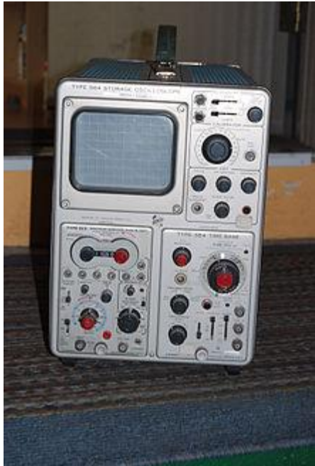
The Model 564 First Mass Produced Analog Storage Oscilloscope

ceramic tube was used for the vertical amp input). A year and a half later the model 321A came out and that was all transistors. [14]